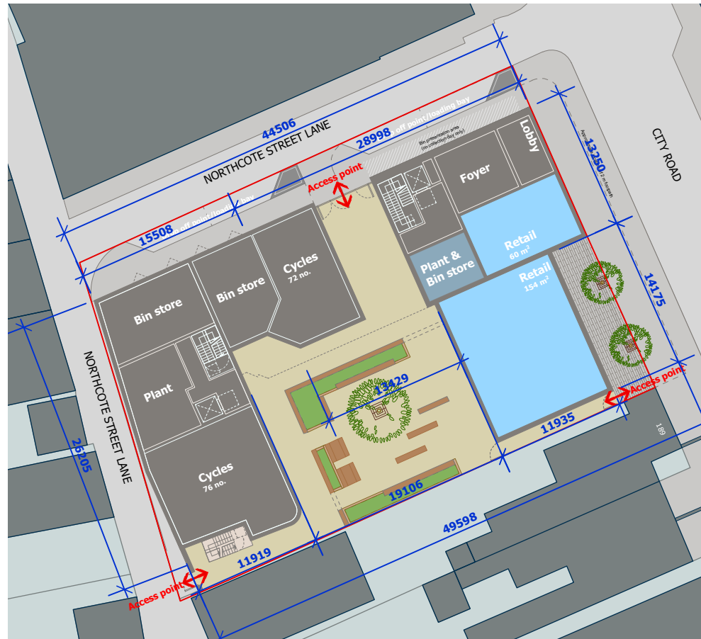
Illustrative - Ground floor plan