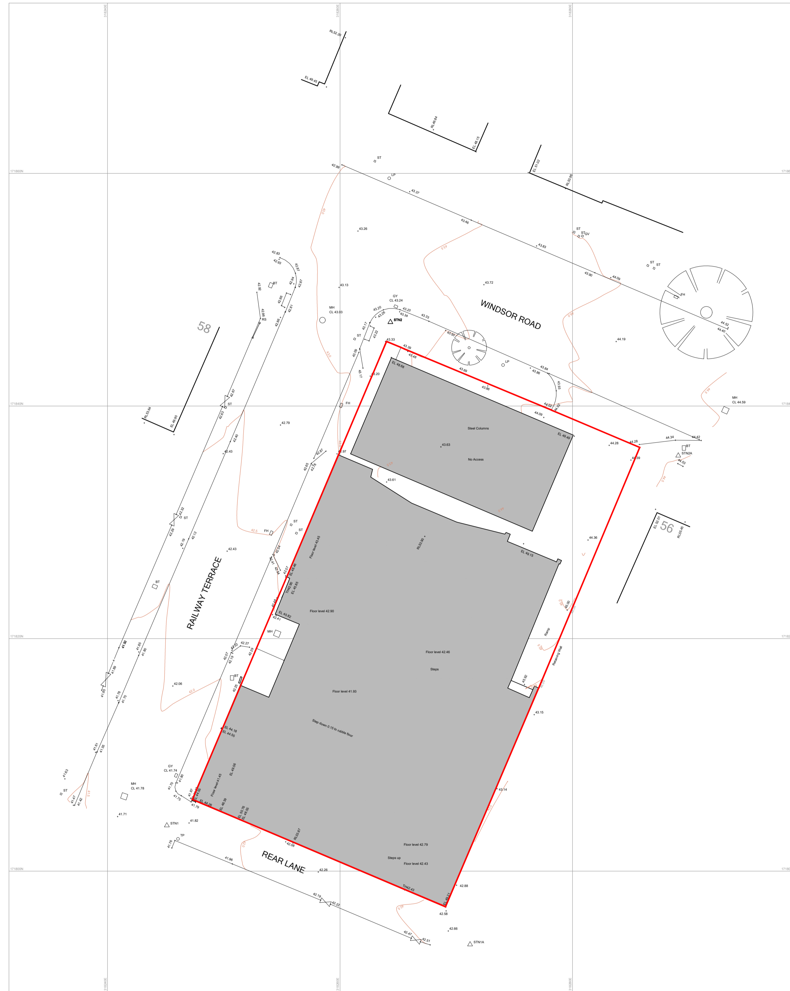
LOWER GROUND FLOOR PLAN 1:200