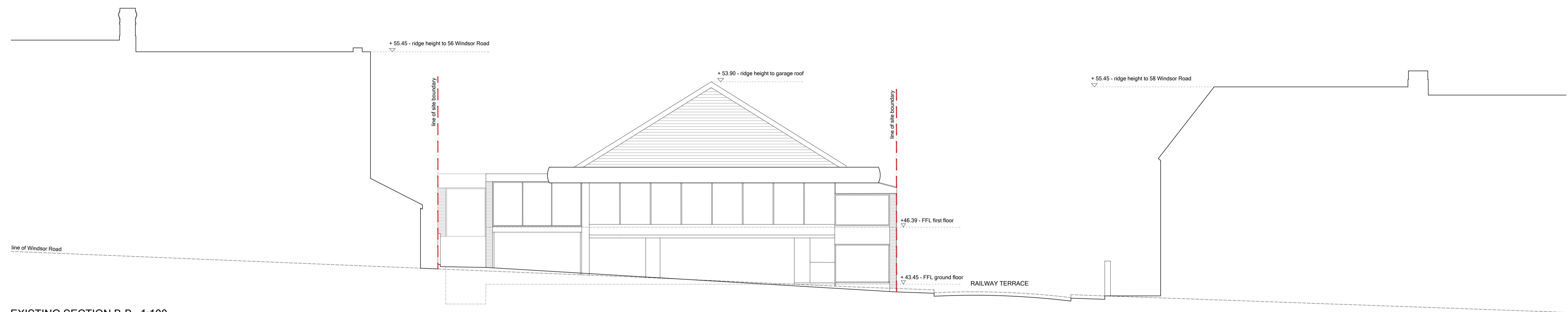
EXISTING SECTION B-B 1:100