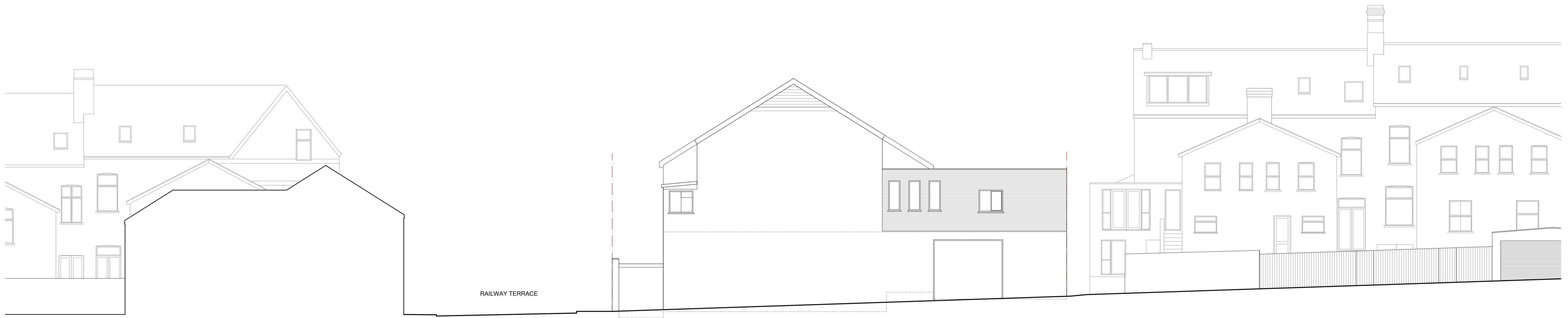
EXISTING ELEVATION TO REAR LANE / REAR OF RAILWAY TERRACE 1:100